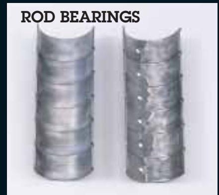
“Minimal wear. These, too, compare to [those in] an engine that had 15,000- to 20,000-mile [petroleum] oil and filter changes.”