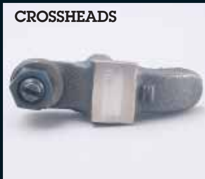
“Again, very, very light wear. These could be put right back in and used again. In an extended drain program [with petroleum oil] there’s a possibility you could see maybe half again as much wear.”

Northern tier over-the-road fleet – In an ongoing demonstration, AMSOIL Series 3000 5W-30 is being used in a fleet of Cummins N-14 engines for extended drain service with oil drains based on the findings of used oil analysis. One change was performed at one year with 125,000 miles on the AMSOIL. The oil was recommended for continued use. Normal oil drains are done at 20,000 miles.