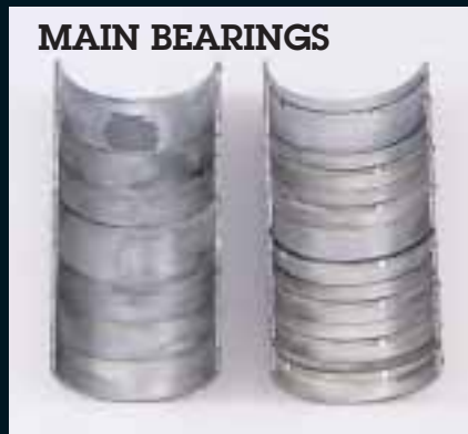
“Light wear. They compare to [those in] an engine that had 15,000- to 20,000-mile [petroleum] oil and filter changes.”